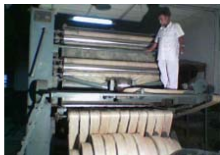
Fig. 1 Finisher Card Machine

One type of jute fibre Bangla white B (BWB) grade was procured as raw material for this experiment. Only Jute fibre was piled with the application of 25% normal emulsion (i.e. 20% mineral oil, 79.7% water and 0.3% nonidet) and kept for 48 hours for maturation. The entire piled jute was processed on breaker card machine for producing 241 tex. (7 lbs. /spy) all jute yarn (Miazi 2002).