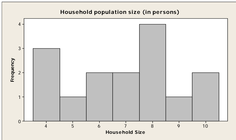
Figure 2: Household population sizes of the respondents

All the respondents interviewed were married and were in monogamous families. The average household size was 6.93 people with the smallest family being 4 and the biggest being 10 (Figure 2)